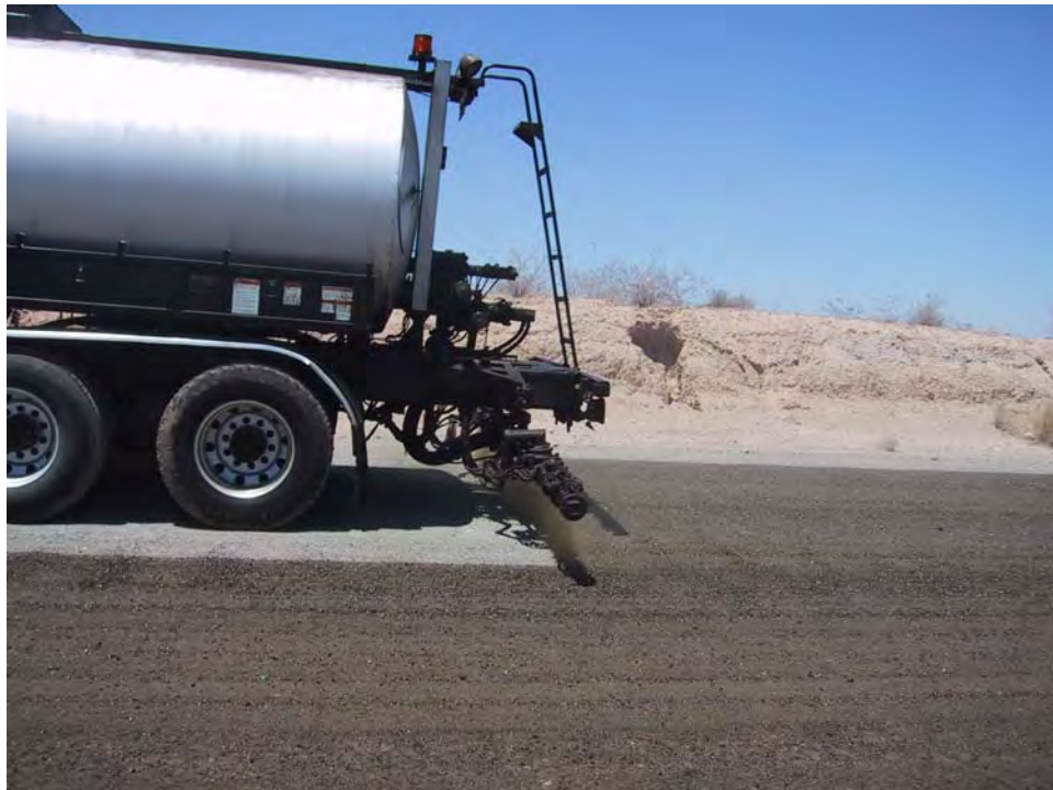
Figure 4. Application of EK35 product at MC