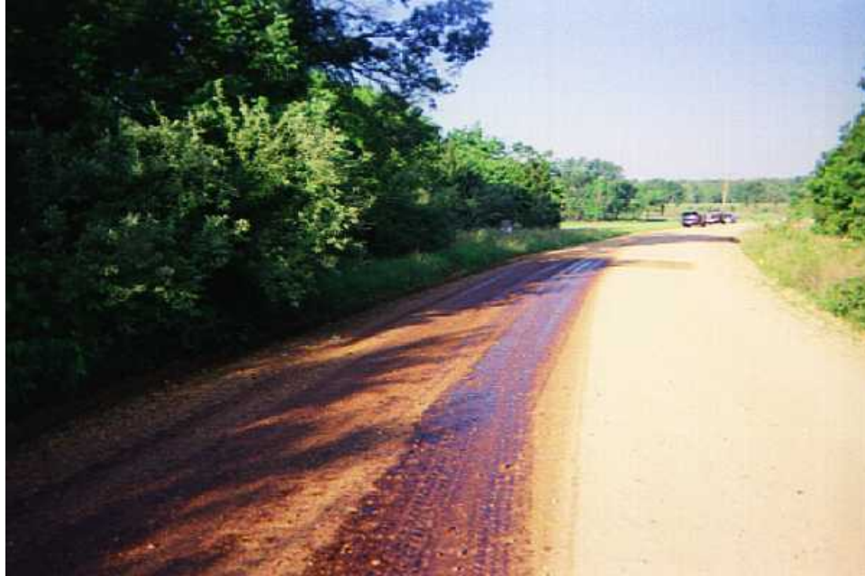
Figure 3. Application of EK35 product at FLW