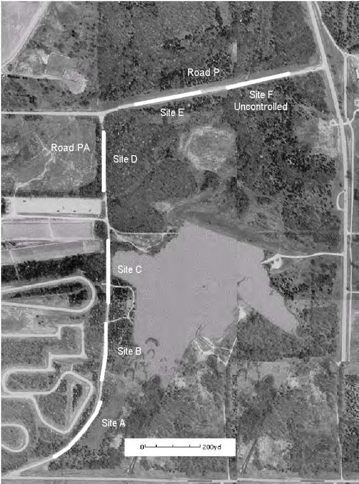
Figure 1. Test locations at FLW